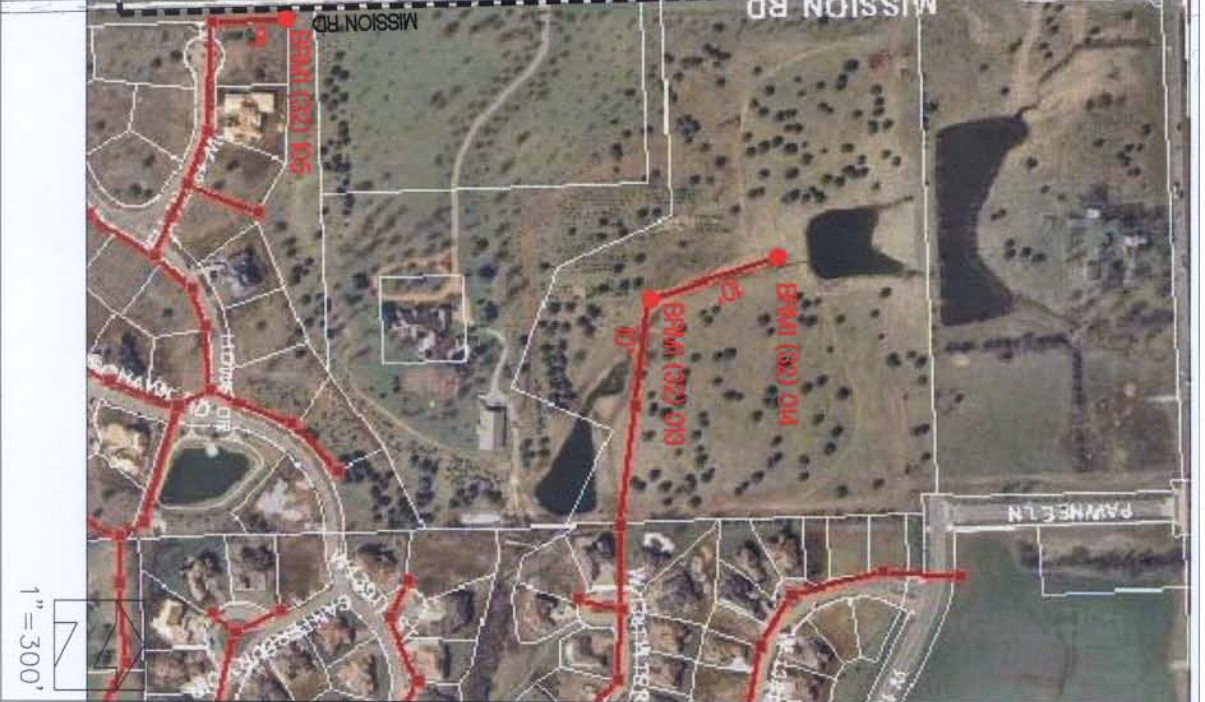
VILLAGGIO AT LEAWOOD SANITARY SERVICE MAP